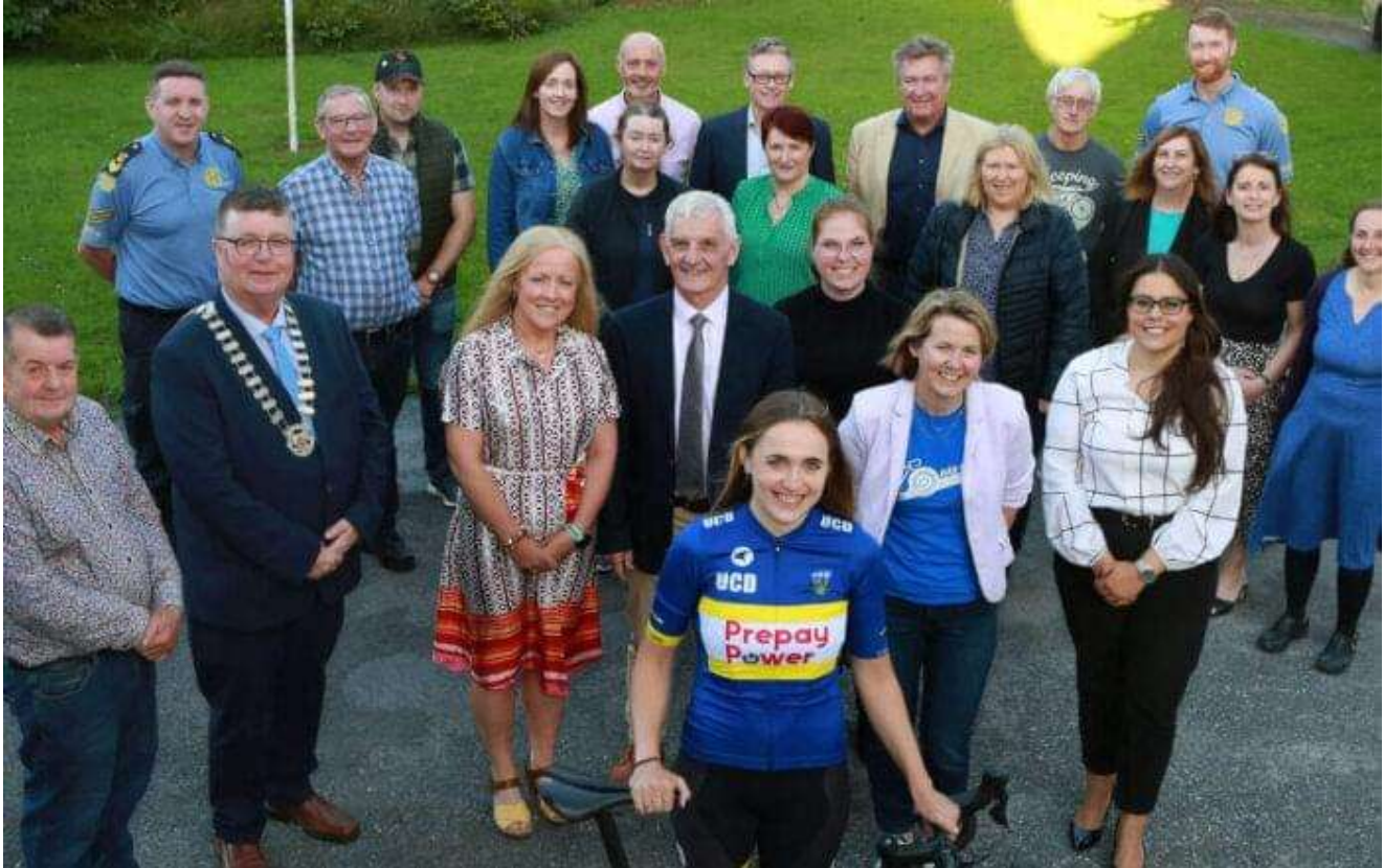
Snap taken at Launch (of Stage 3) in Mountrath (Bloom HQ) on 23 rd July

For the full stage 3 race route see https://ridewithgps.com/routes/41818995 .